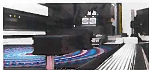
The measure bar on the Agfa Anapurna H1650i LED.

Agfa Graphics recently expanded its wide format hybrid industrial built Anapurna LED series for sign and display professionals with a new 1.65 m wide hybrid printer. The new Anapurna H1650i LED is the smallest hybrid printer in the Anapurna range. It is designed to be an accessible and cost effective production tool, to serve as an entry level workhorse for print service professionals, who want to make the transition into real and robust production and high quality output.