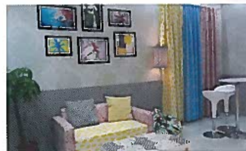
HP had designed a booth that featured decorative applications and textiles.

Mimaki's focus on textile is clear from the new Tx300-1800, which will simultaneously ship textile pigment inks and dye sublimation inks. This hybrid solution offers many advantages to stylists and designers, because it will print on a very wide range of textiles, without having to change ink supply systems. A response perfectly adapted to market demand. ●