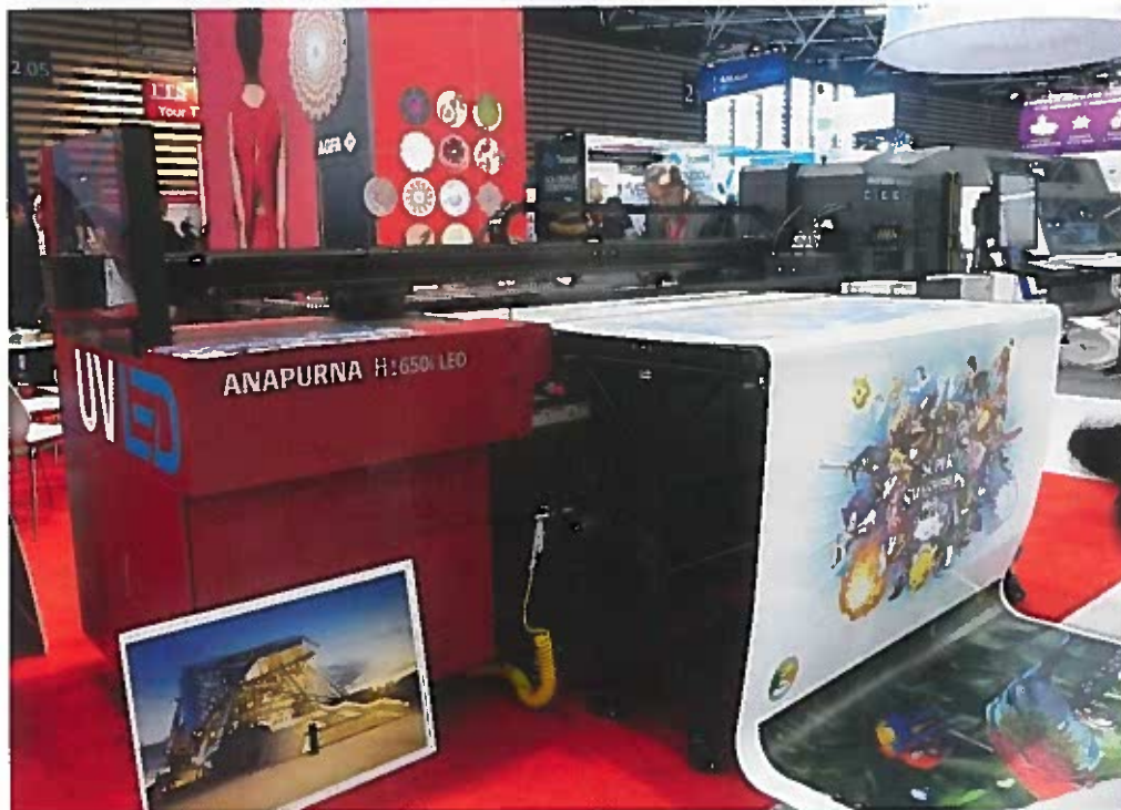
Agfa-Anapurna H1650i at C!Print Lyon.

Leading suppliers of large format visual communication had responded and, combined with traditional printers, visitors were able to pick up many ideas for new applications.