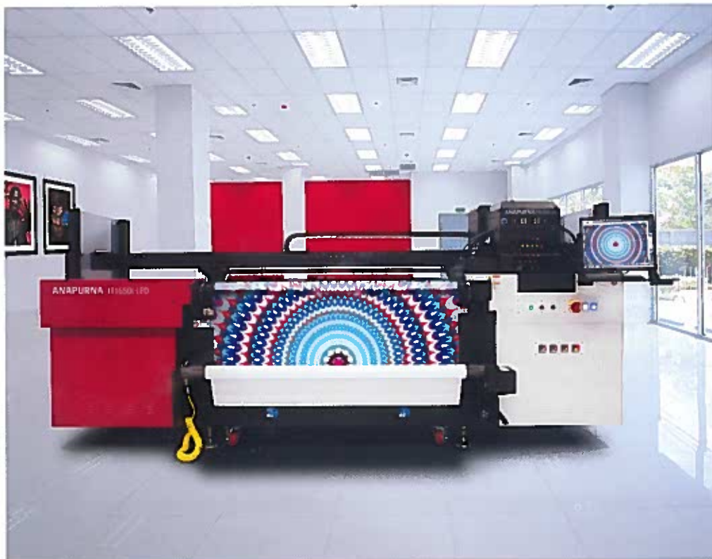
The Agfa Anapurna H1650i LED in action.